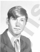
Joseph C. Wilson